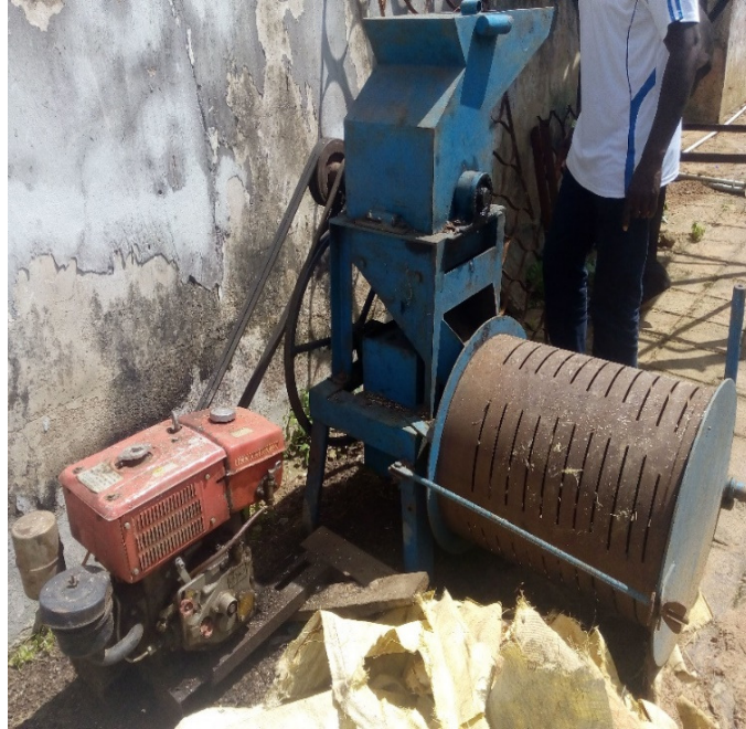
Fig 5: Picture of the Fabricated Palm Kernel Shelling Machine