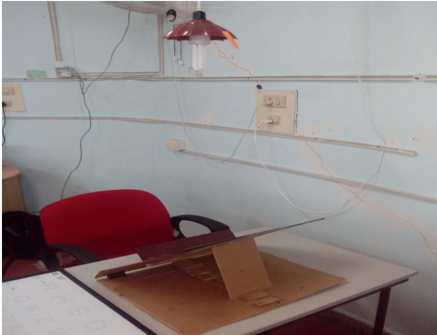
Figure-1 Experimental seating arrangement of participant for reading ischihara colour vision plates under different lighting sources.