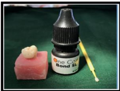
Application of Bond

88 Etching was done to make the surface smear free. Samples were then bonded 89 with One coat Bond SL by Coltene and light cured with LED light for 20 90 seconds and restored with BRILLIANT-EverGlow-Coltene submicron hybrid 91 composite light cure composite resin. The specimens were stored in distilled 92 water for 24hrs.