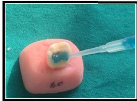
Etching of Dentin Surface

88 Etching was done to make the surface smear free. Samples were then bonded 89 with One coat Bond SL by Coltene and light cured with LED light for 20 90 seconds and restored with BRILLIANT-EverGlow-Coltene submicron hybrid 91 composite light cure composite resin. The specimens were stored in distilled 92 water for 24hrs.