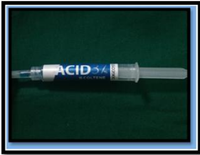
37% Phosphoric Acid