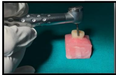
78 79 The buccal surfaces of the samples 80 grinded with the help of straight 81 fissured diamond abrasive up to dentin surface

80 Dentinal surfaces were acid etched with 37% phosphoric acid into following 81 groups: