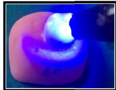
Curing After Application of Bond

96 Specimens were then transferred to the Universal testing machine with a 97 crosshead speed of 0.5mm/min until fracture with tip diameter 1.5mm. It was 98 subjected to compressive test determination which created buckling of the 99 restoration. It resulted in formation of a tensile stress in the dentinal walls.