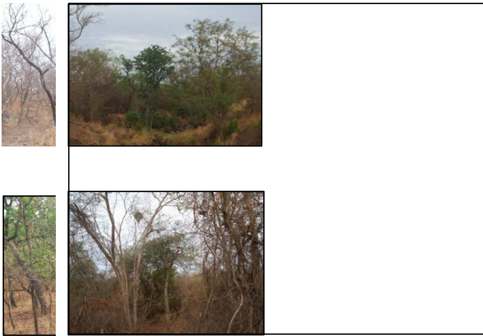
Figure 1: Crowded Vegetation Covers.

From the result of image analysis, the increase in farmland, bare land and built-up areas by 36.07%, 8.23% and 0.89% accordingly from 1976 to 2009 have decreased vegetation cover by 54.76%. These reduce accessibility to vegetal resources such as fuelwood the major source of generating domestic energy, and significantly deteriorate community range lands. For example, 'dol' Kwabuku floodplain at Kala'a that retains water and palatable pastures in the dry season (February to May) is affected by the main road (Hong to Mubi) that passes through has reduced its utility due to reduction in surface coverage, surface water, succulent