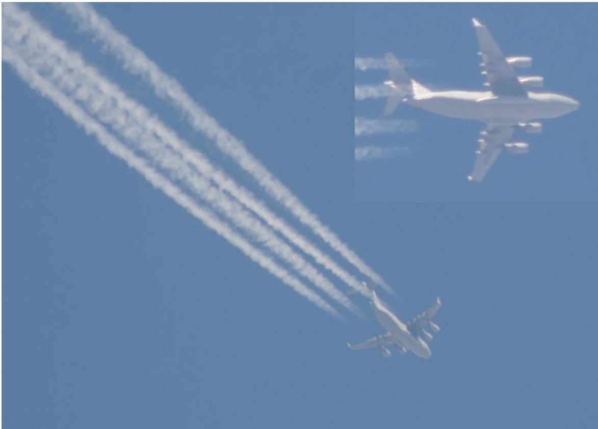
111 112 113 Fig. 3. U. S. Air Force jet emplacing particulate pollution in the air above Palm Springs, California 114 (USA); inset shows the underlying marking. 115 116

100 101 There is evidence that at least as far back as 1958 the U. S. Air Force was engaged in jet-spraying 102 particulate pollution into the air [19]. Fig. 3 is a photo of a U. S. Air Force jet spraying particulate trails 103 in the air over Palm Springs, California (USA) on February 14, 2014. The U. S. Air Force Document 104 AFD-0561013-001, published in 2005, lied about the aerial spraying: One section of that document 105 entitled The Chemtrail Hoax states in part: " There is no such thing as a 'Chemtrail' [a term some use 106 to describe the aerial spraying] ... Contrails [ice crystals from aircraft exhaust moisture] are safe and 107 are a natural phenomenon. They pose no health hazard of any kind. ... The Air Force is not 108 conducting any weather modification experiments or programs and has no plans to do so in the 109 future. " [20]. 110