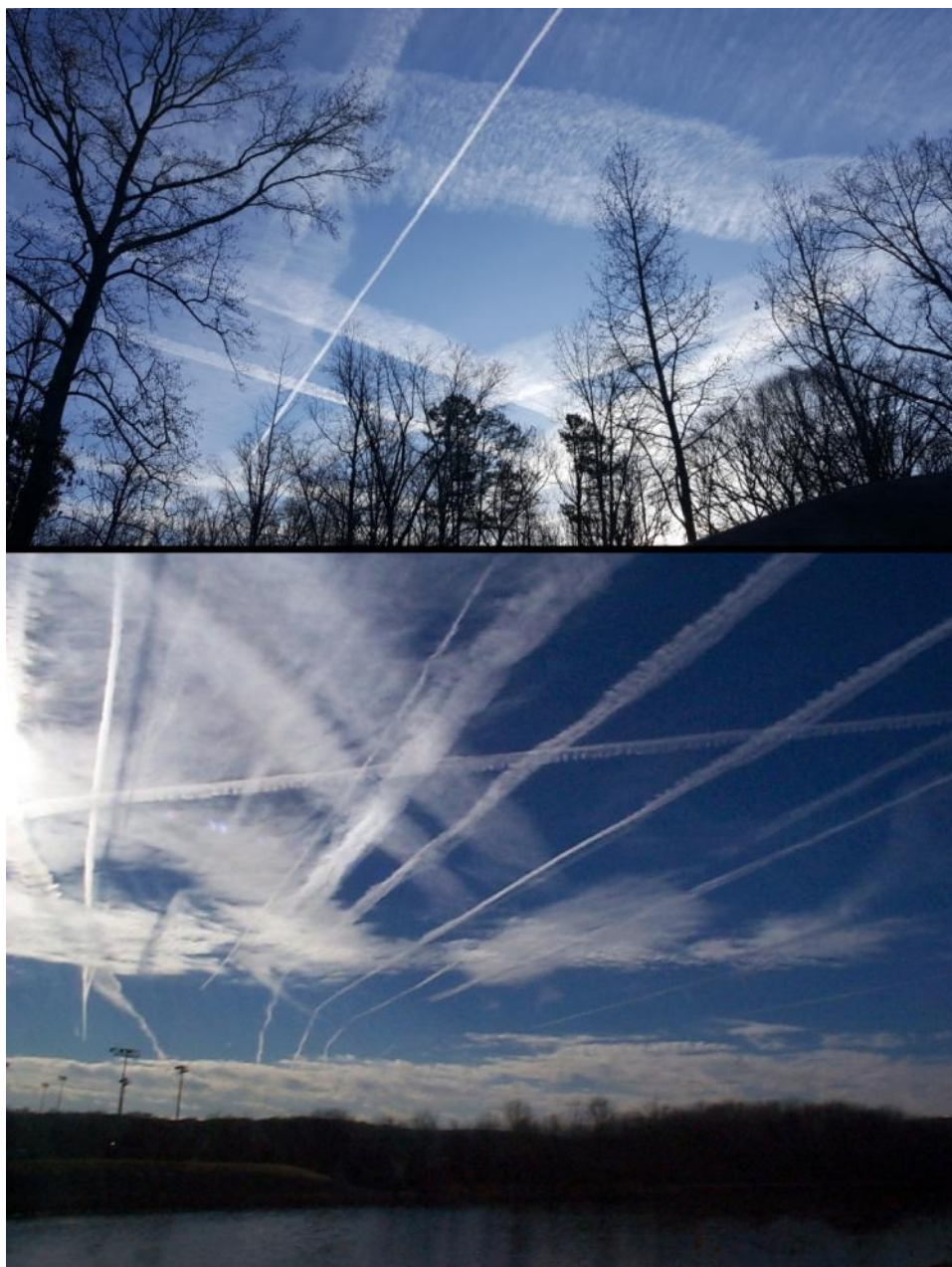
122 123 124 Fig. 4. Lower: NASA photograph dated January 26, 2001 labeled “contrails.” Upper: Aerosol 125 particulate trails across the sky February 4, 2017 in Soddy-Daisy, TN (USA).

127 128 On or about 2010, the aerial particulate spraying became a near-daily, near-global activity, 129 presumably under aegis of some secret international agreement [12]. There may be many 130 undisclosed agendas for covertly spraying particulates into the atmosphere, for example, to modify or 131 weaponize weather. But only one seems likely to garner widespread secret support, namely, 132 emplacing pollutant particulates into the atmosphere to counteract greenhouse-gas global warming.