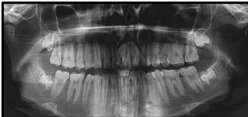
Fig. 8. OPG

prevalence varies widely between studies, from 1 in 718 to 1 in 14000. [10] The predominant clinical manifestations of affected individuals are enamel hypoplasia (enamel is seemingly correctly mineralized, but thin), hypo mineralization (subdivided into hypomaturational and hypo calcification), or a combined phenotype, which is seen in most cases. [6] The trait of AI can be transmitted by an autosomal-dominant, autosomal-recessive, or X-linked mode of inheritance. [6, 7] The distribution of AI types is known to vary among different populations. In a study in Sweden, 63% of the cases were inherited as autosomal-dominant. In contrast, in a study in the Middle East, the most common prevalent type of AI was found to be autosomal-recessive. [11]