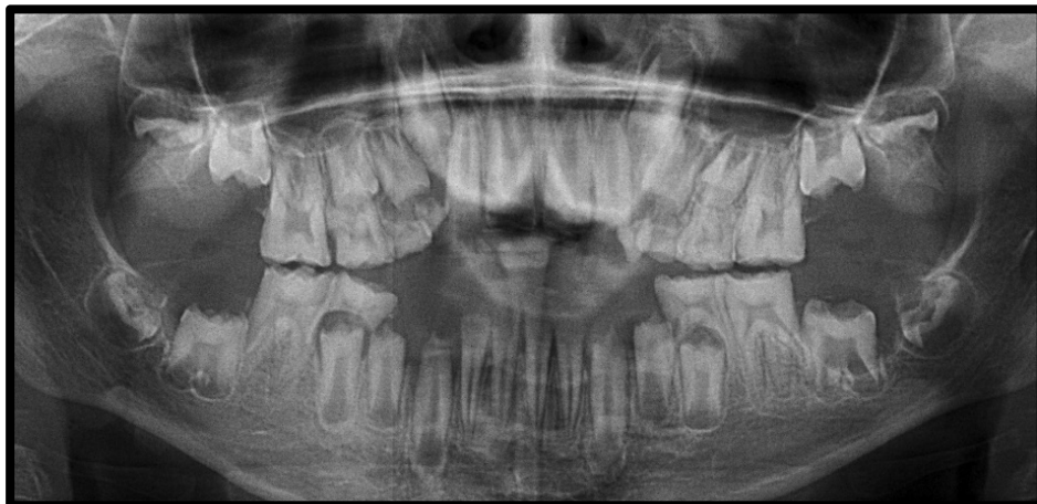
Fig. 5 OPG

Amelogenesis Imperfecta represents a group of conditions genomic in origin, which affect the structure and clinical appearance of the enamel of all or nearly all the teeth in a more or less equal manner and which may be associated with morphologic or biochemical changes elsewhere in the body. [9, 22] AI had been first reported in 1890. It was considered a clinical entity distinct from dentinogenesis imperfecta only in 1938. Its