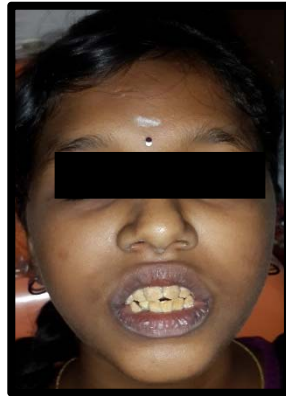
Fig. 1.Extra oral view

frequent chipping of the tooth as stated by the boy. He presented with anterior open bite and proximal contact spaces were lost in the dentition. On palpation through probing, the enamel was hard in consistency underlying the plaques and the calculus. The occlusal surfaces were attrited giving a flat plane.