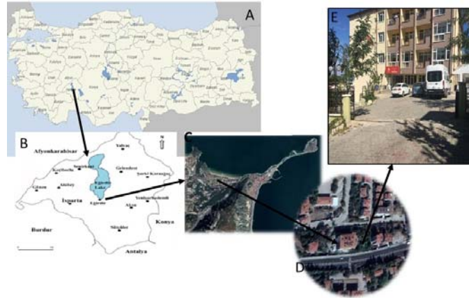
Figure 1. The aerial view and location of Egirdir Nursing Home (A: The map of Türkiye, B: The map of Isparta province, C: Aerial view of Egirdir town, D: Aerial view of Egirdir Nursing Home, E: Egirdir Nursing Home building).

Egirdir Nursing Home is that the only nursing home in that town consists of a single building in Yazla neighborhood of Egirdir town, Isparta-Türkiye. Figure 1 shows the general aerial view and it's near environments.