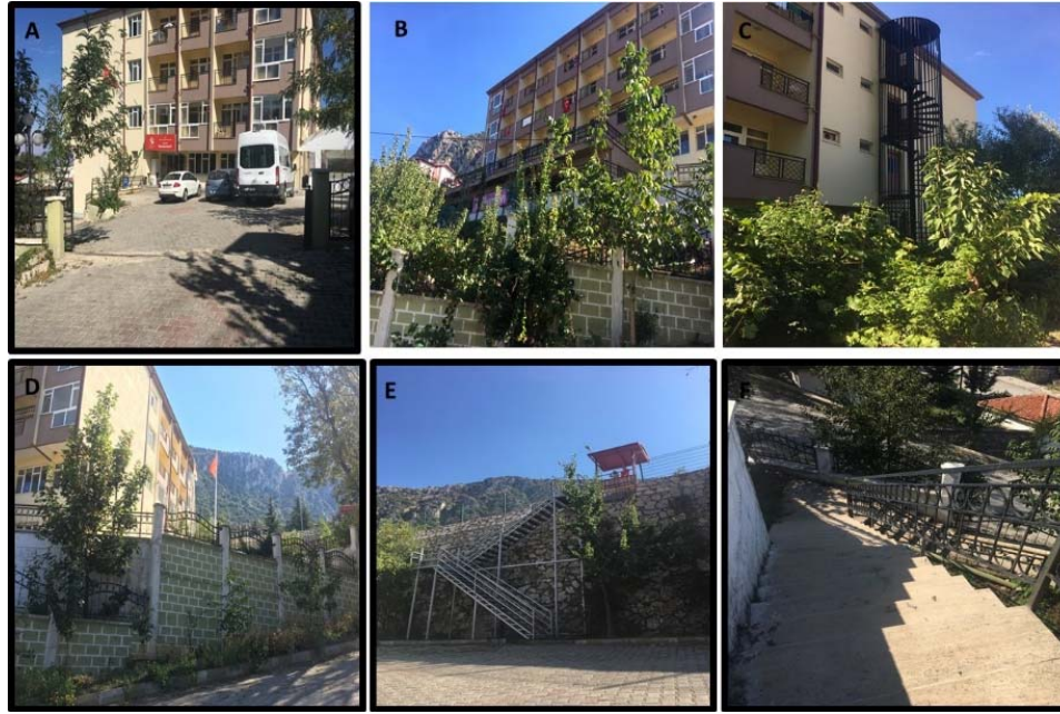
Figure 2. General view of Egirdir Nursing Home (A: Main entrance way to the building, B: Outside view, C: Fire escape, D: Exterior walls, E: Stairs leading to the intercity road, F: Stairs leading down to the lower garden).

The location of a nursing home and its near environment are very important for elderly. Figure 3 shows the general location and near surroundings of Egirdir Nursing Home. Its near environment has religious facilities (mosques), a primary school, a vocational school and residential homes ( Fig.3 A, B, C ). In these locational placements, staff and some of the elderly who live in the nursing home could be able to reach town center or many common places by walking. However, it has an attractive view on Egirdir Lake that residents and staff could be enjoyed by simple looking to surroundings ( Fig. 3B and C ). A seating element was placed for lake and residential area view ( Fig. 3E ), hard surface pavements was found on the garden ( Fig. 3E ) and terrace ( Fig. 3F ). Moreover, a high terrace that close to a dining hall could provide a pleasing image on sightseeing to near environment including some elements and objects. The open space besides the main building was especially reserved area that has been utilized for gaming or similar activities ( Fig. 3D ). It is important to note that this special area is very important functions that could make be positive effects and useful for elderlies who want to enjoy gaming and spent time in action that involving himself.