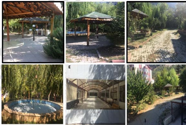
Figure 5. Some garden objects, elements and design specifications (A, B, C, F: Seating elements for resting and watching the environment, D: Pool, E: Specially reserved area for games and activities).

The elderly should be realized by simply looking at garden, object and elements, or in other ways passively experiencing building surroundings where plants are prominent. Figure 5 shows some garden objects, elements and design specifications for this house unit. The pergolas are very useful elements for resting and enjoying surroundings (Fig.5 A,B,C,F). However, there is a pool surrounded by broad leafy trees (Figure 5D) and a specially designed area for playing some activities and games in the garden (Figure 5E).