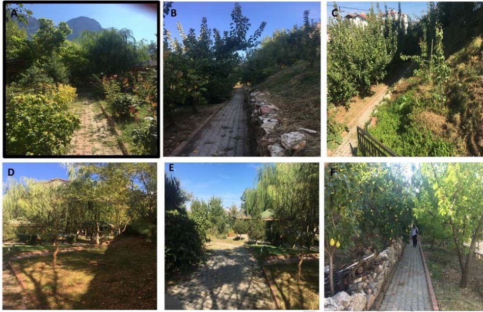
Figure 4. Appearance of Egirdir Nursery House's garden (A, B: Ornamental plants on the side of walking path, C: Aromatic plants near the stairs, D: Some ornamental plants, E: Leafy trees, F: Fruit trees).

The elderly should be realized by simply looking at garden, object and elements, or in other ways passively experiencing building surroundings where plants are prominent. Figure 5 shows some garden objects, elements and design specifications for this house unit. The pergolas are very useful elements for resting and enjoying surroundings (Fig.5 A,B,C,F). However, there is a pool surrounded by broad leafy trees (Figure 5D) and a specially designed area for playing some activities and games in the garden (Figure 5E).