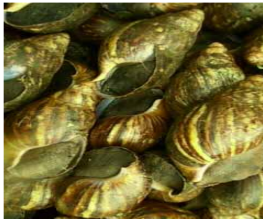
Plate 3: A. marginata