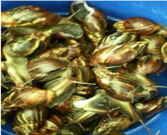
Plate 1: A. fulica