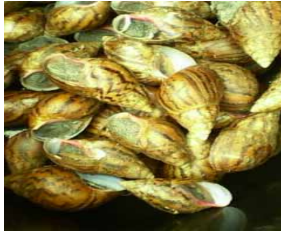
Plate 2: A. achatina