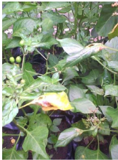
(d) (e) (f) Plate A: Fruit of bell pepper, Plate B: Fruits of Long Pepper, Plate C: Bell Pepper treated with AMF + PM Showing the leaves, fruits and flower, Plate D: Long pepper treated with PM, Plate E: Long Pepper treated with AMF + PM, Plate F: Jos pepper treated with AMF + PM