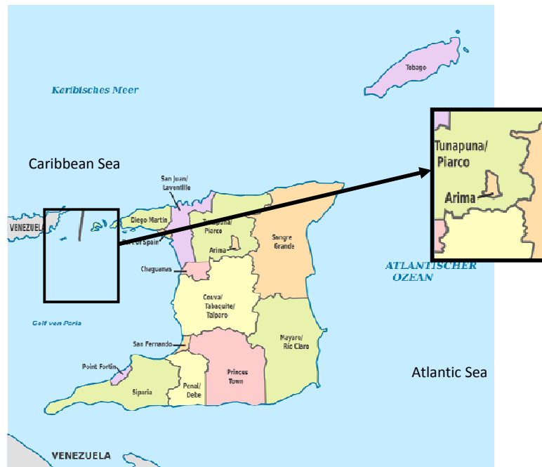
Fig. 1. Geographical map of Trinidad and Tobago showing the locality of individuals surveyed for dengue virus fever in Trinidad and Tobago

July 2017, among patients with suspected dengue infection. The study was carried out at two health care facilities of the North Central Regional Health Authority (NCRHA) in Trinidad of the twin Island, Trinidad and Tobago with catchment areas as indicated in the figure below (Figure 1). This area has a high population density in the country and most dengue cases in the past were localized to this region.[13] This region was chosen as the area of study so as to reassess the current burden of dengue virus infection. This study was carried out among patients who presented to these healthcare facilities with suspected dengue infection. Fever characterizes suspected dengue infection along with the following symptoms - anorexia, rash, aches and pains, vomiting and nausea, abdominal pains and warning signs include positive tourniquet test, leukopenia, thrombocytopenia (platelet count <150 \times 10^9/L ), abdominal tenderness, clinical evidence of plasma leakage and/or increase in haematocrit [14]. The study enlisted voluntary participants who gave written consent and were systematically randomly selected. Standardized data collection form was used to obtain epidemiological information from all enrolled participants who were seen and physically examined by medical personnel in the study.