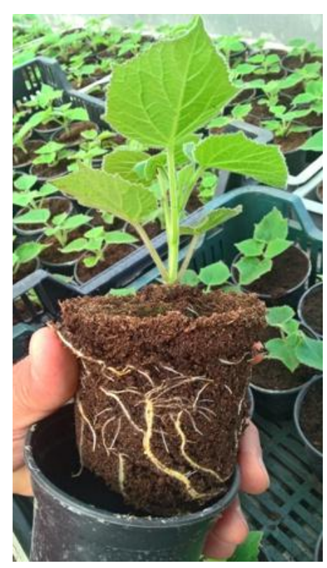
Figure 1. Rooted green cuttings

In table no. 4 are given data about height (growth increase) of the plant, the number of leaves, length and width of leaves after 21 days of planting green cuttings. The growth of the plant is visible as well as the increase in the number of leaves and the increase of the most developed leaf. In Fig. 1 you see a well-developed root system.