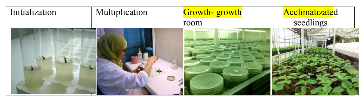
Figure no. 4 "In vitro" production

After the initialization and establishment of tissue culture, the material multiplication continued every four weeks. The plants grew first in the tubes for safety from the infection, and later they were placed in glass jars of 370 ml with 50-70 ml of MS media. Preparation for acclimatization implied the transfer of plants to the rooting medium where they spend 12-15 days to form the root system. After rooting, the plants are removed from the medium and washed in lukewarm water to remove the remains of the media. Before planting, pots were filled with supstrat and watered with water in which the fungicide is dissolved. Planting is done in a greenhouse. Young plants are planted in individual plastic pots, sprayed and covered with a glass jar, to create microclimate and for easier moisture maintenance. After 4-5 days, the jar is removed and the plants are covered with lutrasil foil and regularly irrigated, as well as the surrounding area. When the root grows through the holes at the bottom of the pots (3 weeks), the plants are placed on a container box, covered with a shadenet and stay there for 3-4 days for complete acclimatization. After that, the planting of plants in a permanent place can begin. At that time they reach a height of about 15 cm and have a well-developed root system.