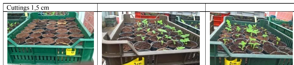
Figure. 3 Root cuttings-growing

Based on the data from Table 4 we conclude that the length of the cuttings had an impact on growth of plants because number of living cuttings 1.5 cm long was the smallest 4 pcs from 30 plants or 1.33%. In the cuttings with a length of 5 cm, there was the best rooting , 26 out of 30 plants or 86.6%.