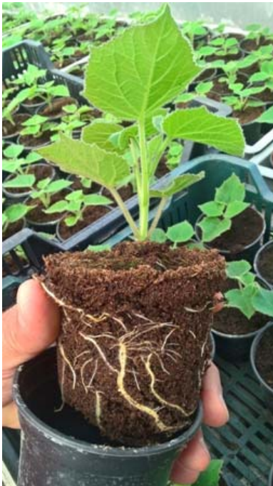
Figure 1. Rooted green cuttings

In table no. 4 are given data about height (growth increase) of the plant, the number of leaves, length and width of leaves after 21 days of planting green cuttings. The growth of the plant is visible as well as the increase in the number of leaves and the increase of the most developed leaf. In Fig. 1 you see a well-developed root system.