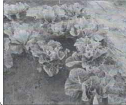
Plates 2a and b: Antibacterial effect of Moringa bark extract in suppressing black rot disease ( Xanthomonas campestris pv campestris ) in field grown Cabbages at 100% and 140% levels respectively.