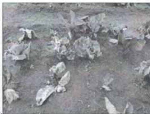
Plates 3a and 3: Antibacterial effect of Moringa leaf extract in suppressing black rot disease ( Xanthomonas campestris pv campestris ) in field grown Cabbages at 100% and 140% levels respectively