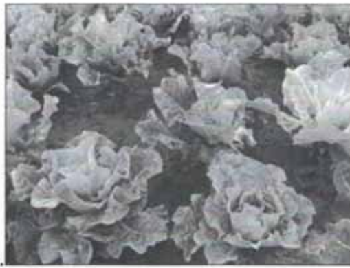
Plates 1a and b: Antibacterial effect of Moringa seed extract in suppressing black rot disease ( Xanthomonas campestris pv campestris ) in field grown Cabbages at 100% and 140% levels respectively.