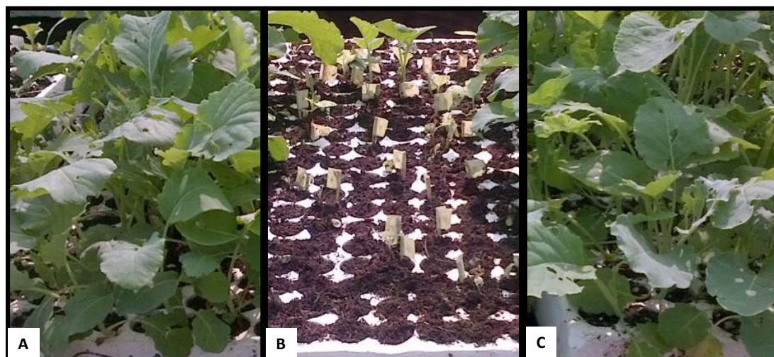
Fig. 2. Effect of growing media on kale seedlings; A- germination mix, B- cocopeat and C- hygromix at week 4 of experiment.

** Highly significant at P < .01 . Means separated by Least Significant Difference (LSD) Test at p \leq 0.05 , means within columns followed by the same letters are not significantly different. Where week 1 to week 4 are dates from 04 April 2015 to 24 April 2015.