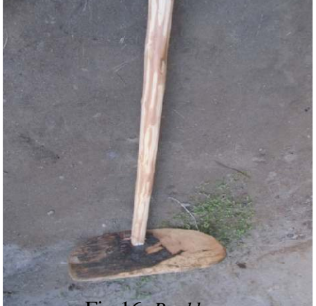
Fig. 16. Pankha