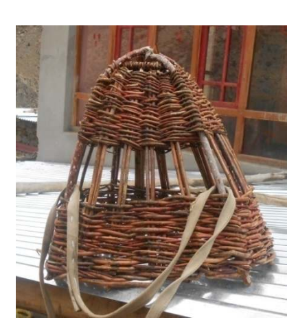
Fig 14. Chepo