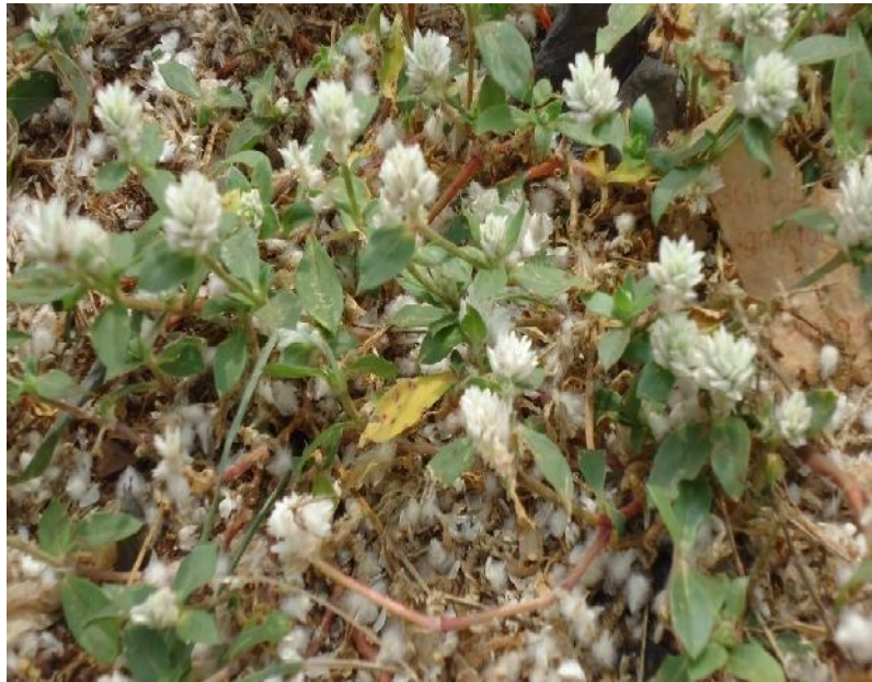
Fig 1: Gomphrena celosioides in its natural habitat.