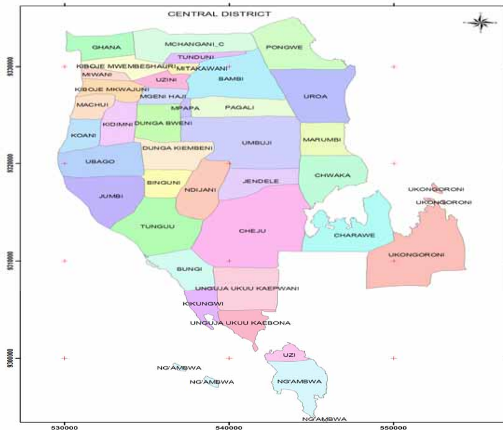
Fig. 2. Map of Central District showing the study area