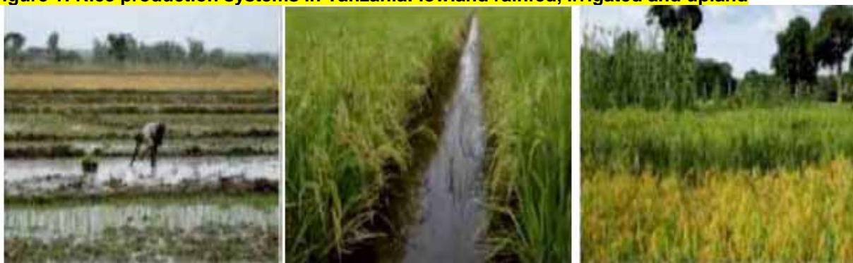
Figure 1: Rice production systems in Tanzania: lowland rainfed, irrigated and upland

De Datta [16] classified rice cultivation in accordance with sources of water supply as either rainfed or irrigated rice. Rice is grown in three major ecosystems, rainfed lowland, upland, and irrigated systems. The area under rice increased from about 0.39 million ha in 1995 to about 0.72 million ha in 2010 [10]. Based on land and water management practices, lands suitable for rice production are classified as lowland (wet land preparation of fields) and upland (dry land preparation of fields) [1]. Further, according to soil water regime, rice production systems have been classified as upland rice with no standing water, lowland rice with 5-50 cm of standing water and deep water rice with greater than 50 cm of standing water during half of the growing season [16]. It is, therefore, of greater importance to explore how the rice production systems associate with the production constraints and final grain yields to assist farmers to opt the best bet technology in their production areas.