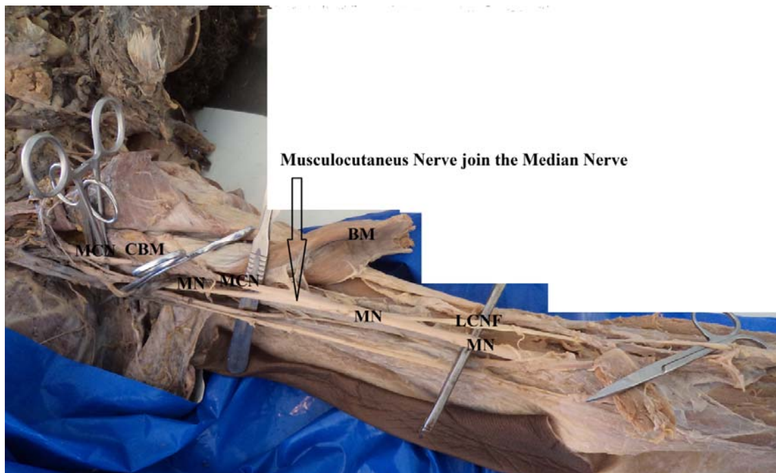
Fig (1) cadaver (1) shows a variation that the left musculocutaneous nerve (MCN) has join the median nerve (MN) at the upper part of the arm, after the MCN piercing the coracobrachialis (CBM) under cover of the biceps brachii (BM). The lateral cutaneous nerve of the forearm (LCNF) present as a branch from median nerve.