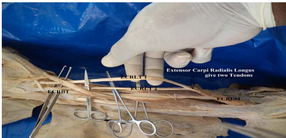
Fig (2) cadaver (2) shows that the extensor carpi radialis longus has two tendons, the main tendon (ECRLT 1) inserted into the base of the second metacarpal bone, the additional tendon (ECRLT 2) inserted in common with extensor carpi radialis brevis (ECRB) in the base of the second metacarpal bone.