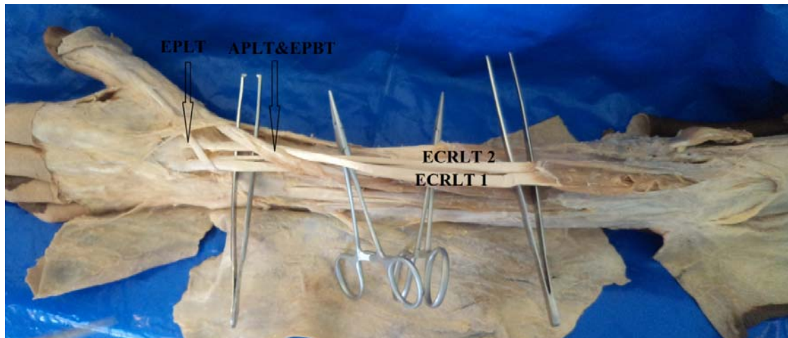
Fig (3) cadaver (2) shows that the tendons of extensor carpi radialis longus muscle on the dorsum of the forearm and wrist joint passes deep to the abductor pollicis longus, (APLT) extensor pollicis brevis tendon (EPBT) and extensor pollicis longus (EPLT) tendons.