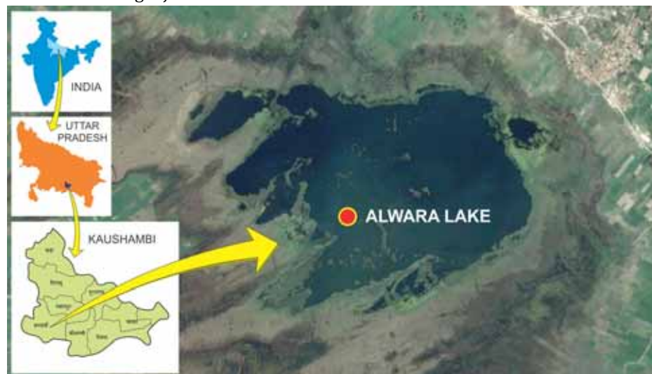
Fig. 1. Study area in Kaushambi district of U. P. (India).

The Alwara lake (Fig. 1, Google map) is a natural lake (Fig. 2) and a part of perennial wetland and is situated between the latitude 25°24'05.84"S – 25°25'10.63"N and longitude 81°11'39.49"E-81°12'57.95"W with altitude MSL – 81.08 meter. It is surrounded by agricultural fields and connected to the river Yamuna and covers more than 1750 hectares. It is located in Sarsawan block of Manjhanpur tahsil of Kaushambi district of Uttar Pradesh. The lake is skirted by villages like; Ranipur, Dundi, Hatwa and Bhawansuri in east, Paur Kashi Rampur, Alwara and Gaura in the north, Shahpur, Umrawan in the south and Mawai, Tikra and Dalelaganj in the west.