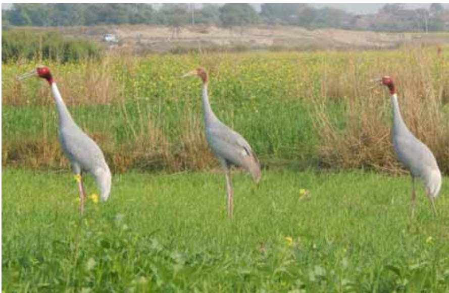
Fig. 4 . Sarus crane pair with juvenile in agro paddy field around Alwara Lake