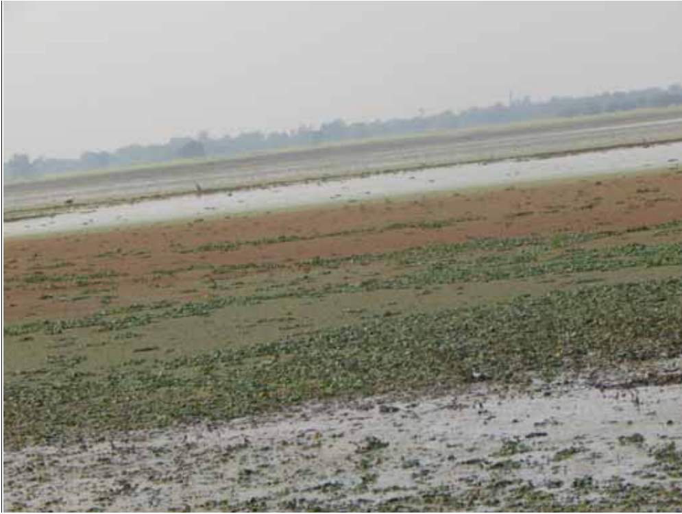
Fig. 2. A view of Alwara Lake of Kaushambi, U.P. (India).