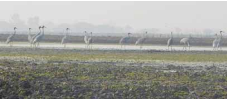
Fig. 6 . Sarus crane in congregation in evening around the study area