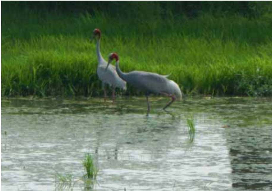
Fig. 3. Paired sarus crane in study area around Alwara Lake