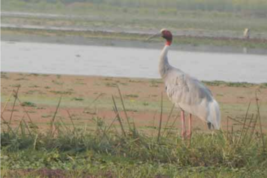
Fig. 5 . Sarus crane in solo around the study area