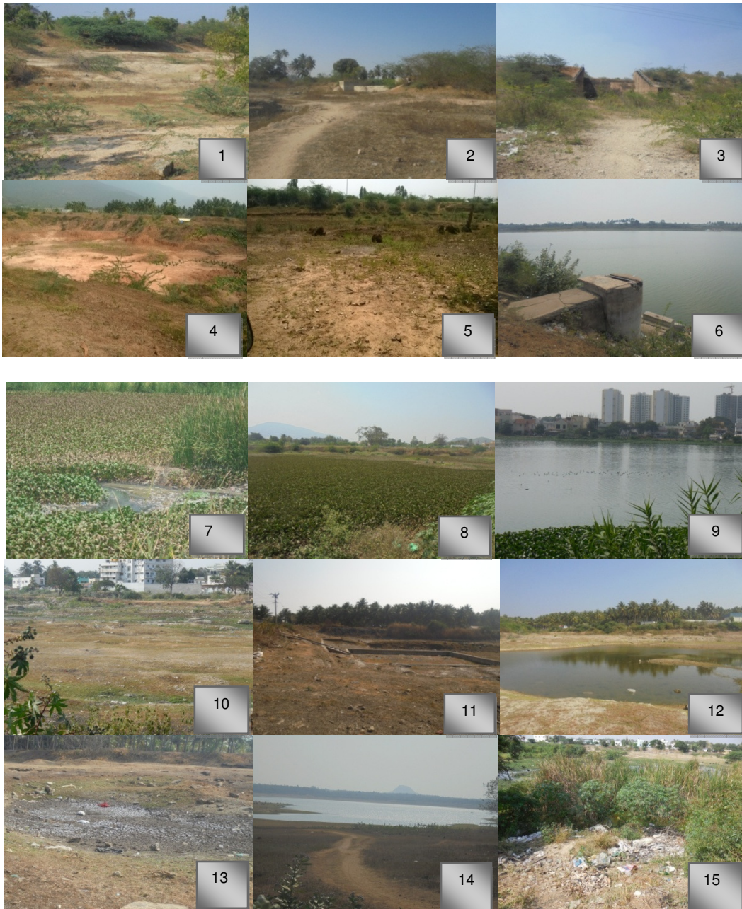
FIG 2 -WETLAND PHOTO