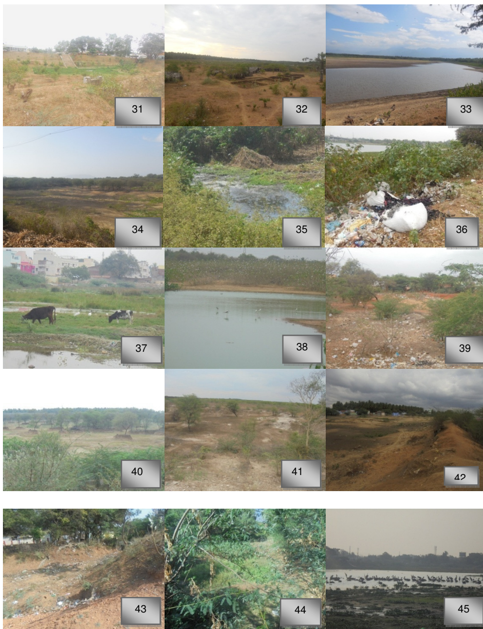
31.Malumichampatty pond, 32.Valasukulam, 33.Vettaikaranpudur lake, 34.Agraharasamakulam, 35.Kadathur lake, 36.Chinnakulam, 37.Selvasinthamanilake, 38.Sengulam, 39.Sundakamuthurlake, 40.Vellalorelake, 41. Kodayampalayam lake, 42. Kottaipalayam pond, 43. Chinnakulam, 44. Kattakaran kuttai, 45. Kurichi lake