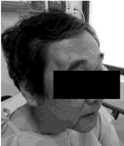
Fig. 1. Clinical image of the patient's forehead showing a visible swelling in the frontal area adjacent to the (R) eyebrow

Physical examination reveals a 2.5cm hemispherical swelling in the fronto-orbital area superolateral to the right orbit that is smooth and non-tender on palpation as shown in Fig. 1. It is hard, deep to the skin, and immobile. There is no overlying erythema, warmth or skin changes.