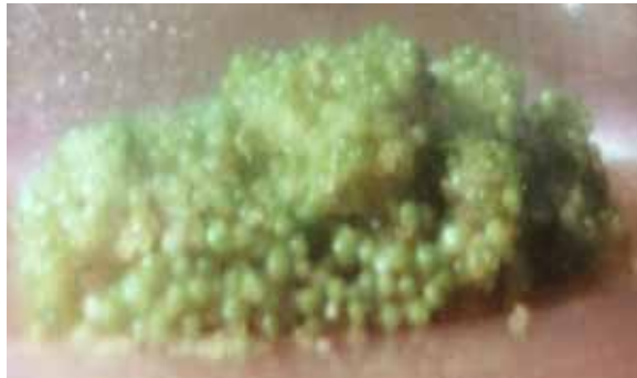
Fig 3 – Initiation of germination of seeds after 40 days