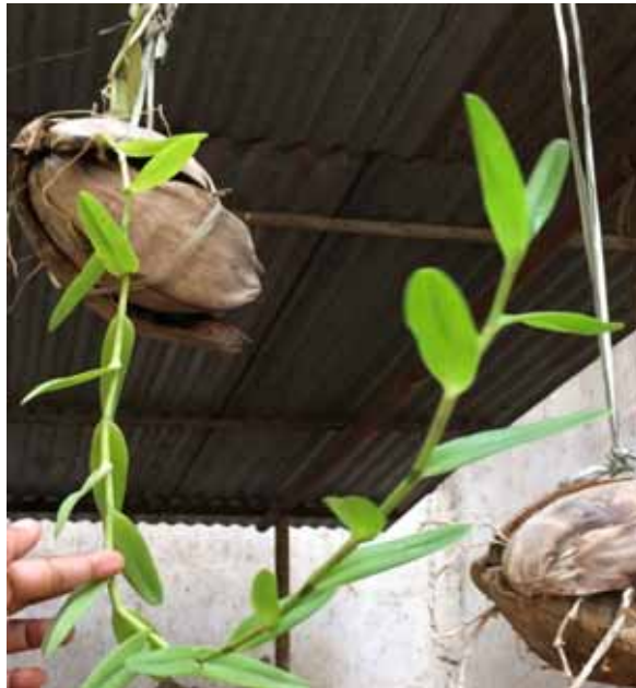
Fig 1- Mother plant- Epidendrum radicans

The observations were made at regular intervals of every 10 days. The seeds responded for the condition provided and started germination within a period of 45-50 days (Fig. 3). The seedlings obtained were allowed to grow in the same conditions till plantlets were observed (Fig.4). After 60 days NPK (20:20:20) solution diluted 10,000 times was sprayed daily to get better growth of the seedling. After 120 days of germination, the seedlings started producing good rooting. Such seedlings were separated and transferred to individual pots, containing broken pot pieces charcoal and moss for further growth, a method normally followed for orchid cultivation.