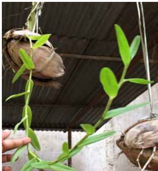
Fig 1- Mother plant- Epidendrum radicans