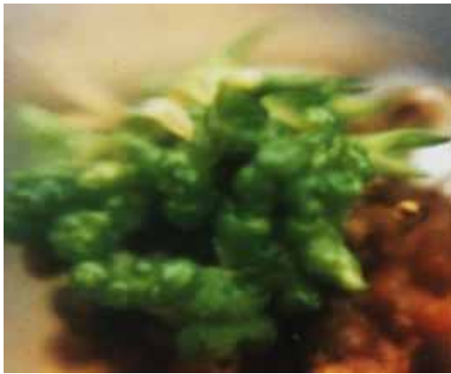
Fig 4 – Plantlet formation after 60 days