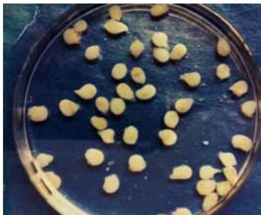
Fig 2 – Sodium alginate beads with Epidendrum radicans seeds