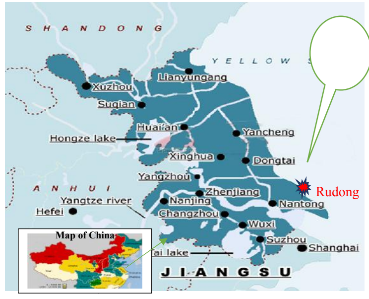
Map.1: Study Area

The study was conducted in Rudong county in the Nantong city of Jiangsu province, east coast of China. Rudong is a municipal government area with 14 towns and 5 districts with an area of 1,872 Km<sup>2</sup> and a total population of 1.08 million people.