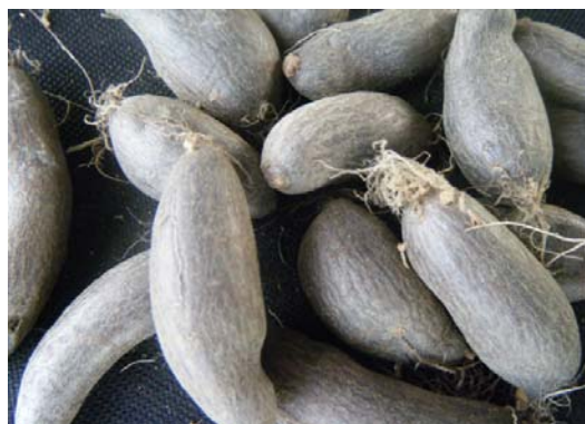
Fig.3. Black cultivar of frafra potatoes