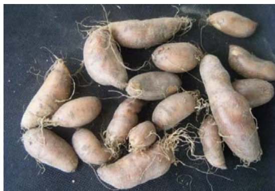
Fig. 2. Brown cultivar of frafra potatoes