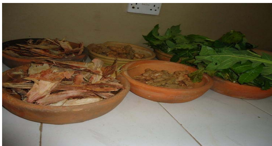
Fig. 1. Botanicals (Neem bark, ginger rhizome, and pawpaw leaves) used for the experiment

Black and brown cultivars of frafra potato tubers were used for the experiment. These tubers were all obtained from a single farm in Bongo-soe, in the Bongo district of the Upper East Region of Ghana. The farm was monitored from planting to harvest. The tubers were obtained on the day of harvest and transported on that same day to the location of the experiment. In all, eight hundred tubers were used for the study. This comprised of four hundred (400) black cultivar tubers and four hundred (400) brown cultivar tubers. The botanicals from which the extracts were prepared from were; matured pawpaw ( Carica papaya ) leaves, neem ( Azadirachta indica ) barks from a matured neem tree, and matured rhizomes of Ginger ( Zingiber officinale ).