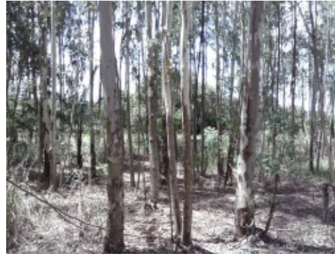
Perennial crop – Eucalyptus grandis