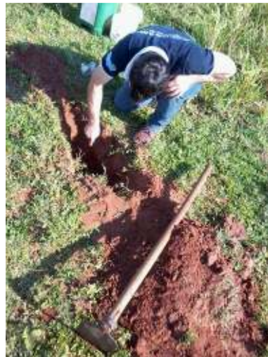
Trench to collect soil