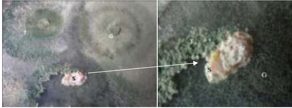
Figure 1. T. harzianum colony(T), S. griseorubens colony (S), G. virens colony (G) on PDA medium, 14 th day after inoculations BCAs.

Growth average of colony diameter S. griseorubens (S) G. virens (G) and T. harzianum (T) in compatibility test (SGT) on 2 nd day after inoculation showed none significantly different when compared with controls (SSS, GGG, TTT). However, on 4 th and 6 th day after inoculations, diameter growth of biological agents such colony in compatibility testing (SGT) was larger and significantly different than the control. On 8 th day, the growth of biological agents on a compatibility test was not different from the control of biological agents (Fig.2)