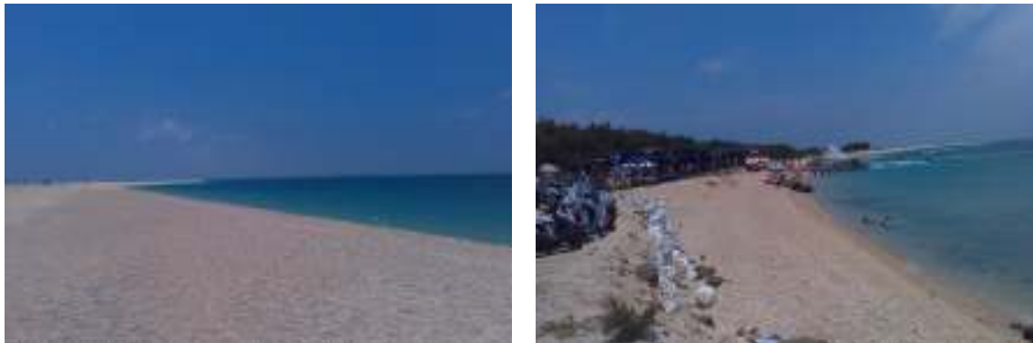
Figure 2-3: Jibei Island Beach